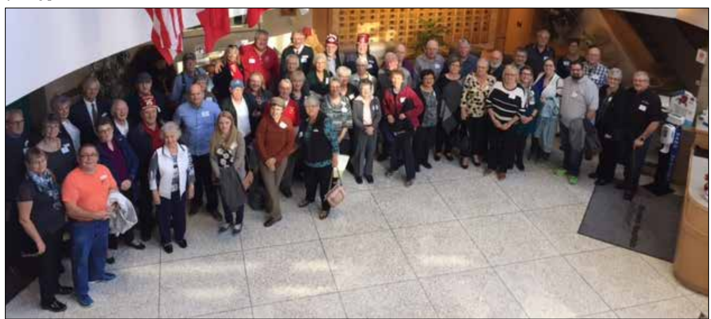
A group of Shriners from Kamloops and various Okanagan clubs took a bus tour to Spokane, October 28th, 2017. They enjoyed a very informative tour of the Shriners Hospital for Children.