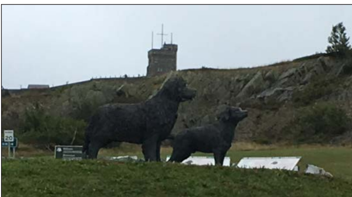
Cabot Tower on top of Signal Hill, overlooking the narrows in St. John's.