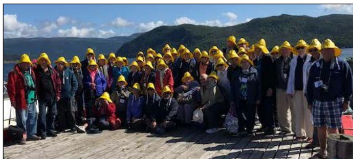
Bonne Bay, where a number of our friends were ceremoniously "Screeched In".

There were 49 Nobles and Ladies who attended the Journey to the East with Lady Michelle and I. It was a 10 day bus trip around Newfoundland visiting a number of areas.