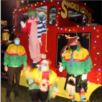
LOCI dressed up for a food drive- The Victoria Clowns held a food drive in December - PAGE 8