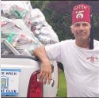
Recycle and fund-raise! - GSBCY has partnered with Return-it Express - PAGE 7