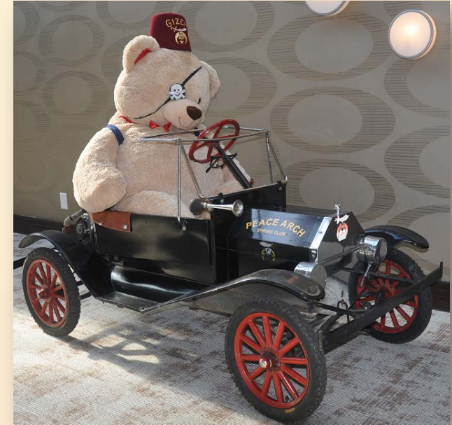
Fezzy Bear and Peace Arch Shrine Club's Tin Lizzy