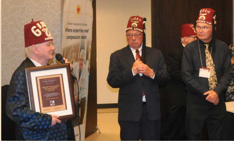
Presenting South Vancouver Island Shrine Club No. 56 their Charter