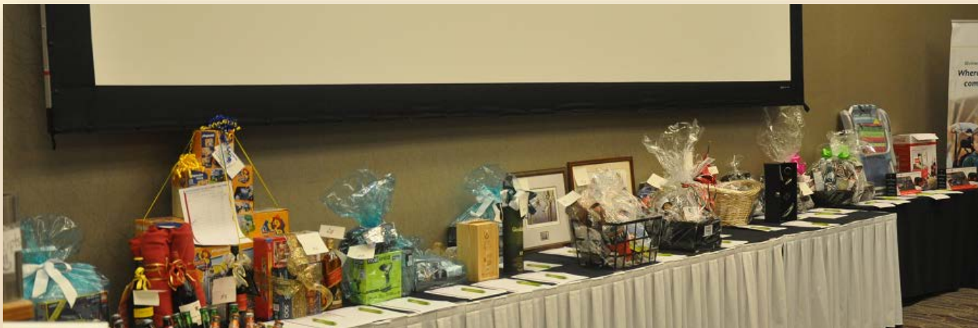
Silent Auction Items