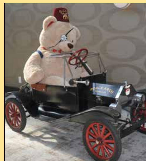
Fezzy Bear and Tin Lizzy at the Spring Ceremonial