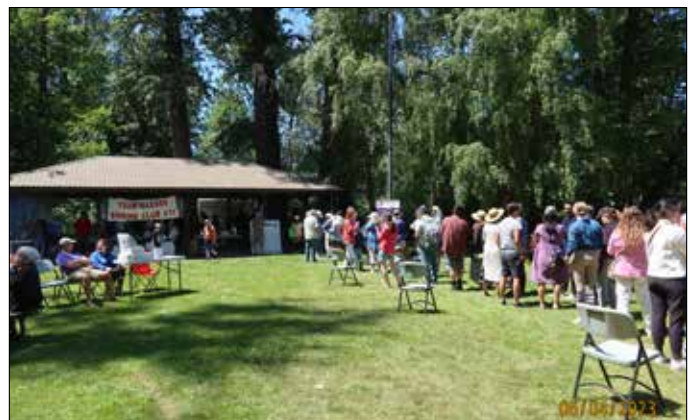
The lineup of people at the Ladner BBQ.