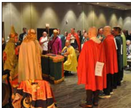
First Section Induction Ceremony Candidates