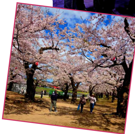
Cherry Blossom time in Japan.