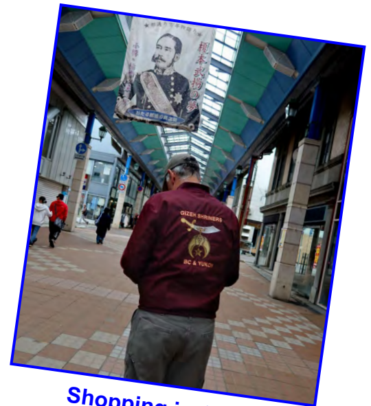
Shopping in Japan.